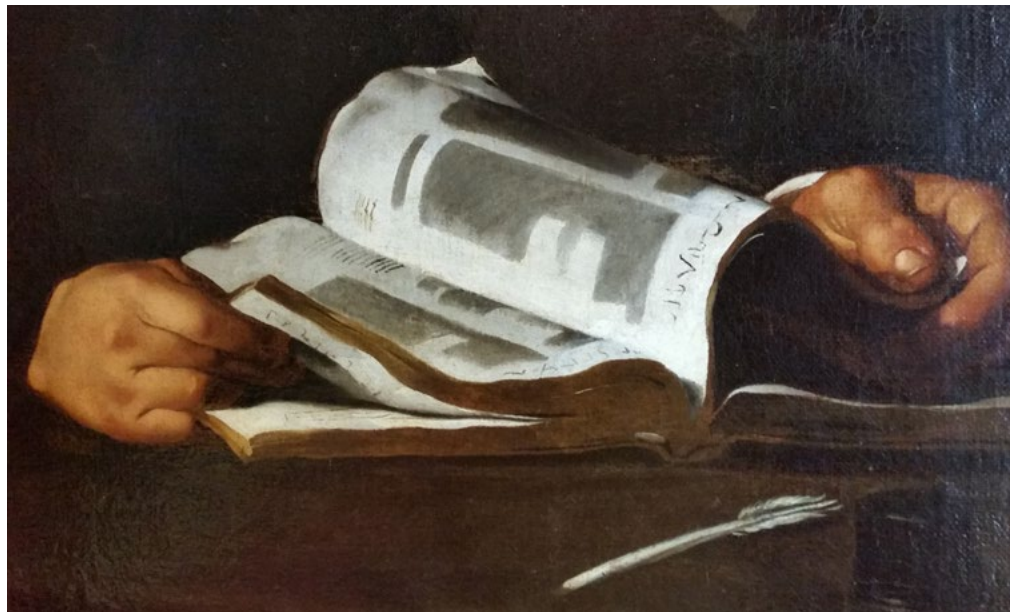
Detail aus: Sant' Agostino, Palermo, Jusepe de Ribera 1591 – 1652

ARCHITEKTUR IN GEBRAUCH Architektur in Gebrauch is releasing two new issues: AG5 and AG6. They are dedicated to witnesses of the tumultuous past 40 years of Bangkok: the former British Council and the house & office of architect Sumet Jumsai, one of the most meaningful architects in Thailand and historian of the aquatic origin of a human culture. architekturgebrauch.de