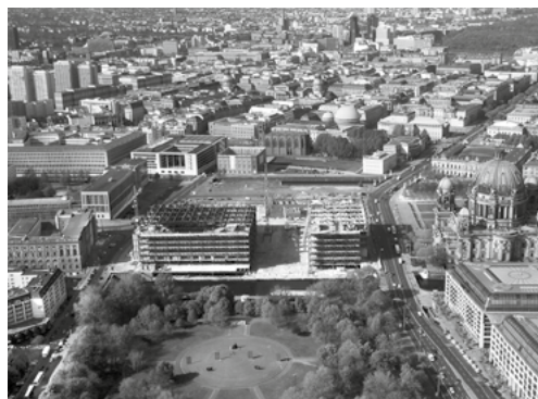
Palast der Republik, Erik Göngrich, 2007

FREE NEWSPAPER ON THE POLITICS OF CREATIVITY